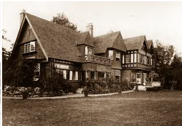
Rattenbury's home Iechinihl

While the colonial history of The Prospect is important, it is only a brief chapter in the overall history of human occupation. There has been Indigenous land use in this area for living, fishing, food and medicine gathering since time immemorial. There are archaeological sites recorded within the boundary of