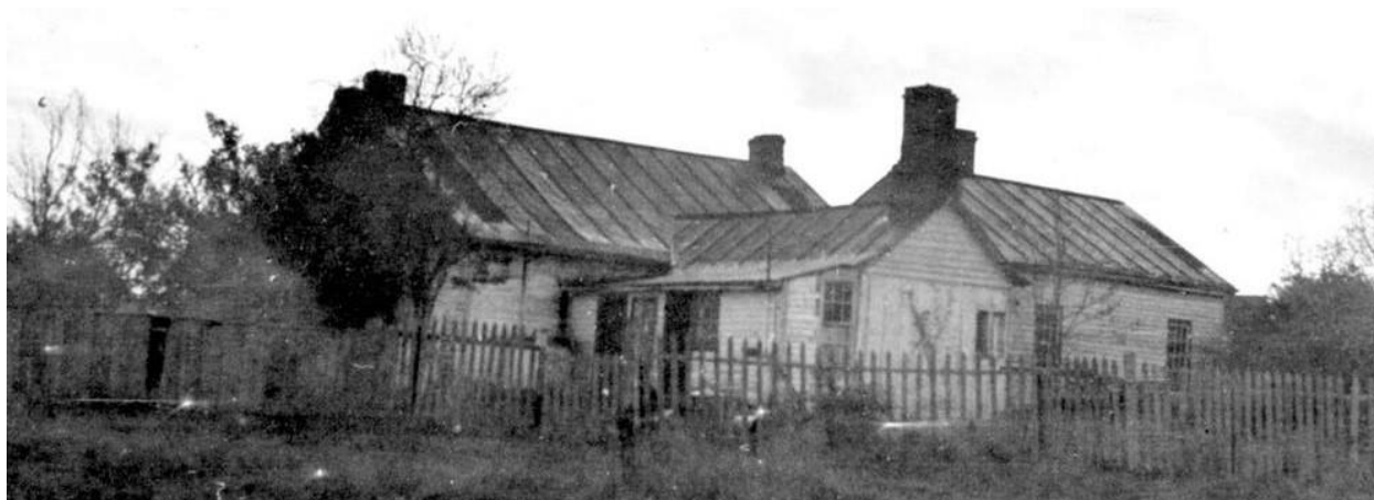
Figure 2 - The rear of Tod House in 1934. Note the tarpaper roofing laid over shakes.