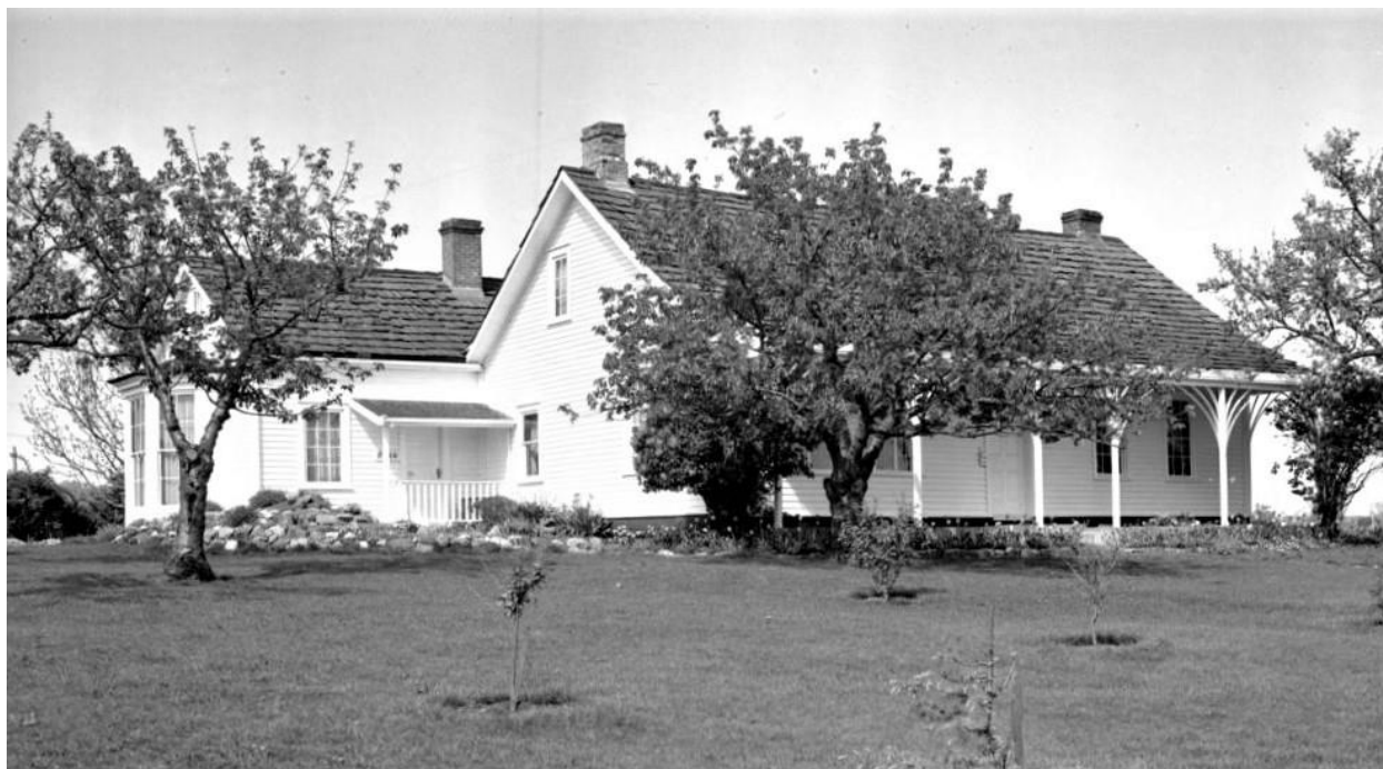
Figure 3 - Tod House circa 1953. Note the split shake roof and rear porch. NB this photo is misidentified in the RBC Archives as an image from 1934.