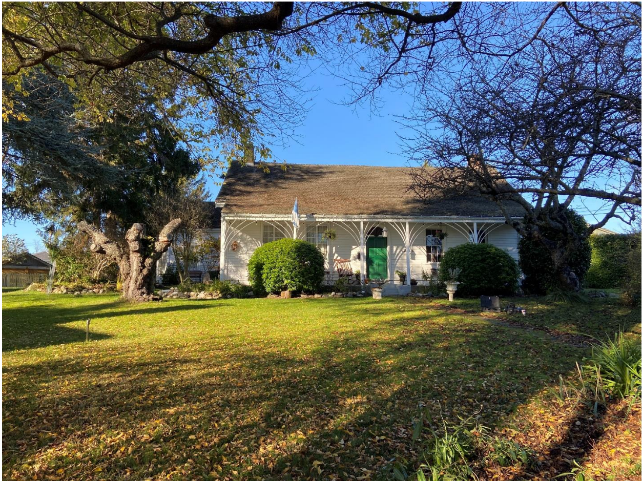
Figure 1 - House and garden of Tod House. October 2019. Heritageworks.