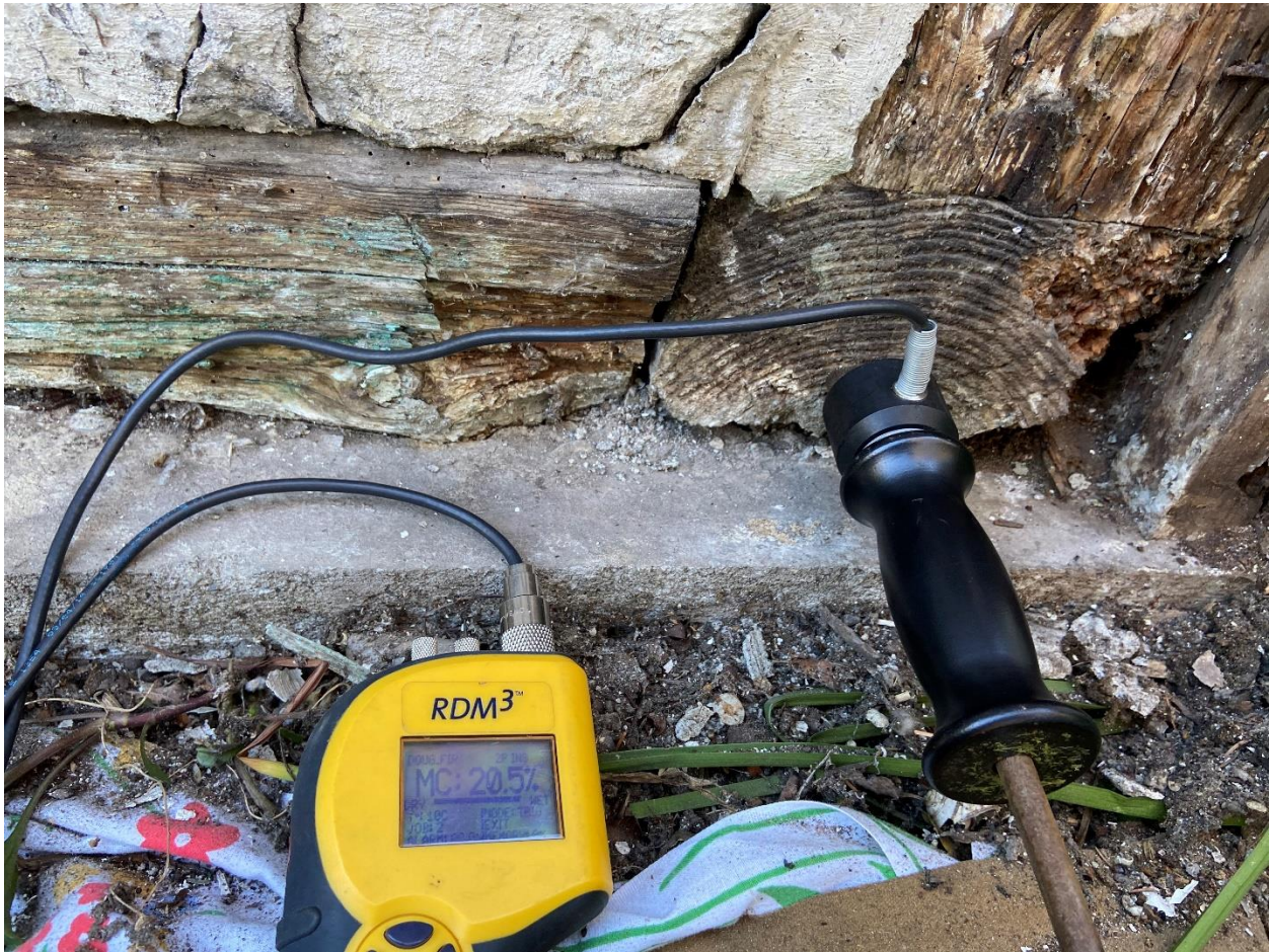
Figure 5 - Wet and rotting sill plates of the original timber structure are revealed during the removal of exterior siding and wall cladding below W6 in the oldest part of the building.