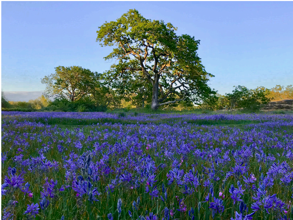
Figure 3—Central Meadow (TU62) in full camas bloom

Although Cattle Point is technically part of Uplands Park, where this document refers to Uplands Park it only refers to those portions of the park west and north of Beach Drive. Where it refers to Cattle Point, it only refers to the area east and south of Beach Drive. When addressing issues common to both units, it refers to them as ‘Uplands Park and Cattle Point’.