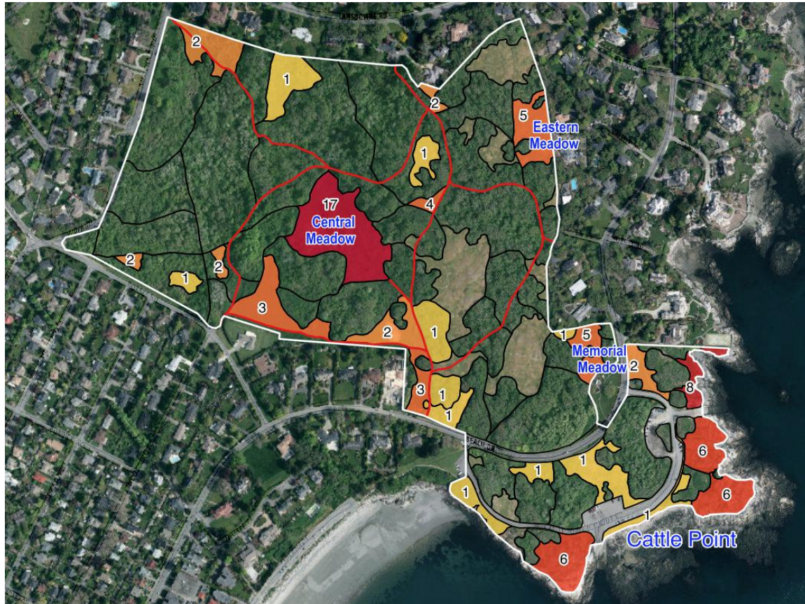
Figure 4—Number of rare plant species per meadow in Uplands Park and Cattle Point

Cattle Point and Uplands Park are home to a total of 24 rare and endangered plant species; with 22 in Uplands Park and 11 in Cattle Point. Numbers shown are for rare plant species currently known to occur in different areas of the park.