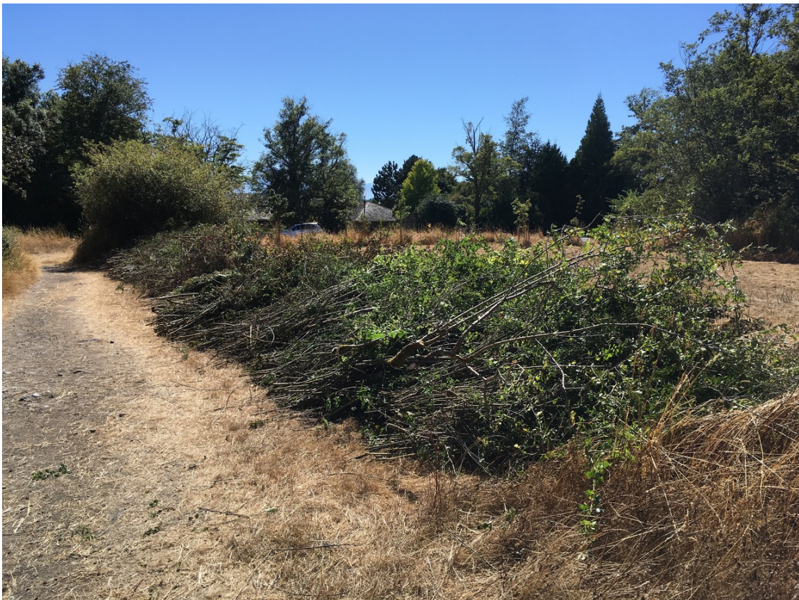
Figure 8—A week's worth of invasive shrubs removed from the park (2018)

While putting out fires in the park must always remain the overriding priority, there are opportunities for minimizing damage to the park's most endangered natural values by providing the fire department with a map of sensitive areas in the park. This has been done in the past, and these maps should be updated periodically, and a short tour through the park with the fire chief organized from time to time.