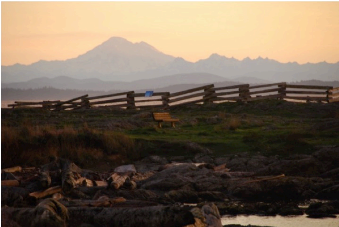
Figure 1—View of Mount Baker from Cattle Point

Uplands Park is bordered on three sides by an urban residential neighbourhood and on its southeastern end by Haro Strait. With an area of 31 hectares, it is the largest in Oak Bay’s park system and accounts for more than 75% of the municipality’s undeveloped natural parkland.