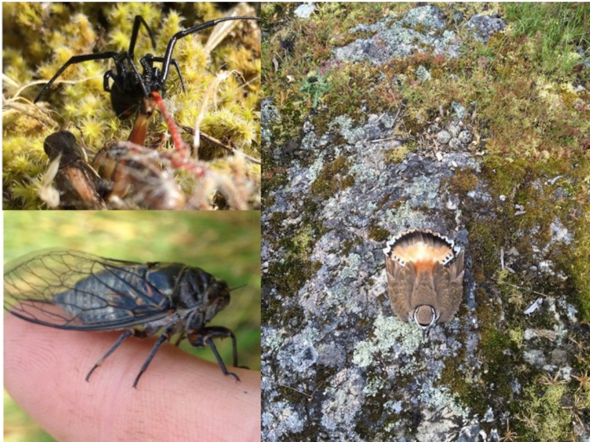
Figure 6—Fauna at Uplands Park and Cattle Point

Clockwise from bottom left: The cicada Okanagana occidentalis , one of only two local species found in Northeastern Meadow (TU68); Western Black Widow Spider ( Latrodectus hesperus ) making a meal of a grasshopper in TU63; and Killdeer ( Charadrius vociferus ) at Cattle Point (TU92) protecting its ground nest of four eggs which can be seen at the top just off the centreline of the photo.