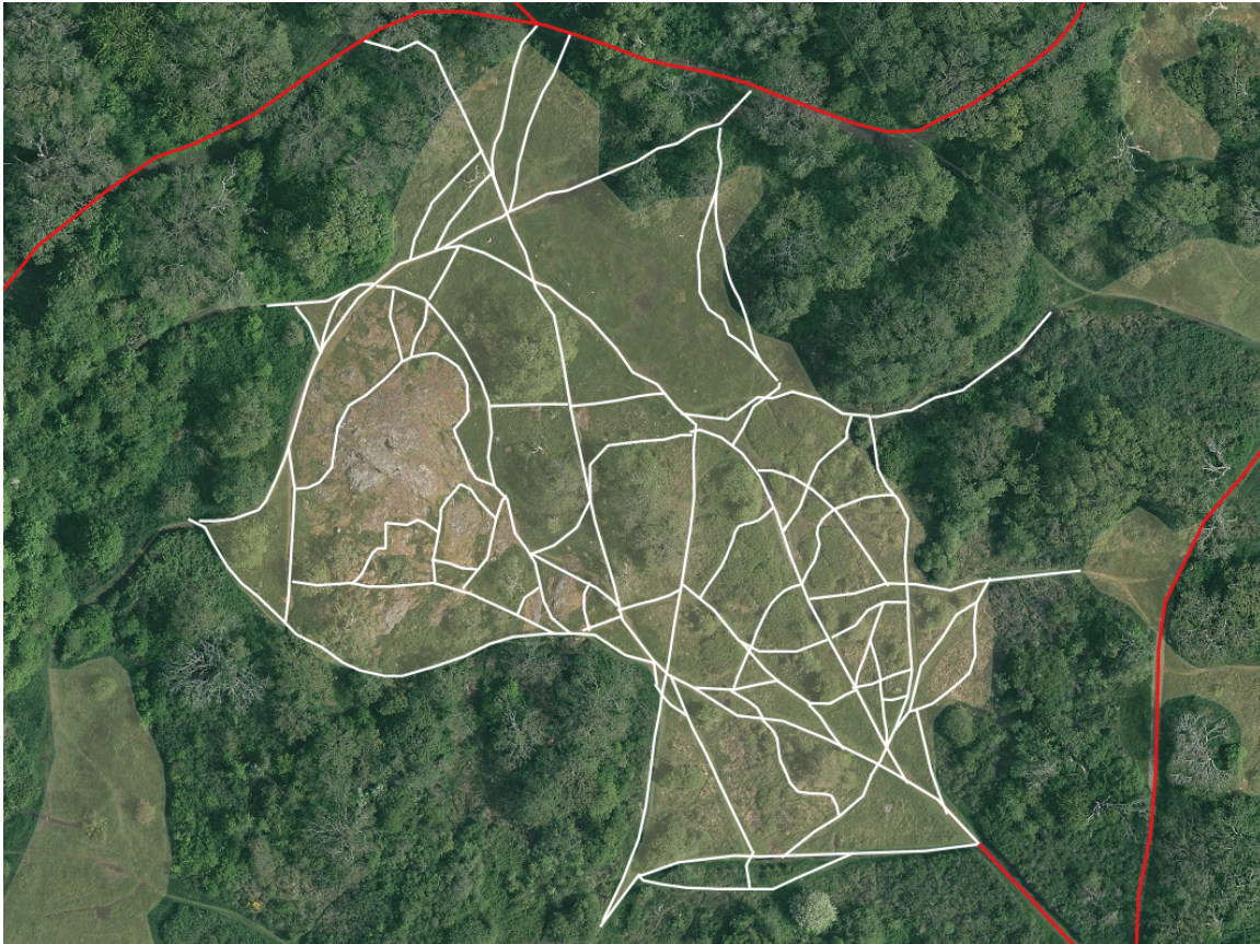
Figure 7—Central Meadow showing the more than 2000 m of informal trails

Dogs can also contribute to habitat loss when they are allowed to dig and run freely over sensitive meadow habitat or when their owners use meadows to play catch. Dog faeces left on site alter the chemical composition of the soil by adding nitrogen, which benefits exotic grasses such as Orchard Grass at the expense of native species, which are adapted to nitrogen-poor conditions (Garry Oak Ecosystem Recovery Team, 2011). A better system is needed for keeping dogs under control and out of the ecologically sensitive parts of the park, one that might include creating a fenced-in section in the park where dogs can run off leash all year long.