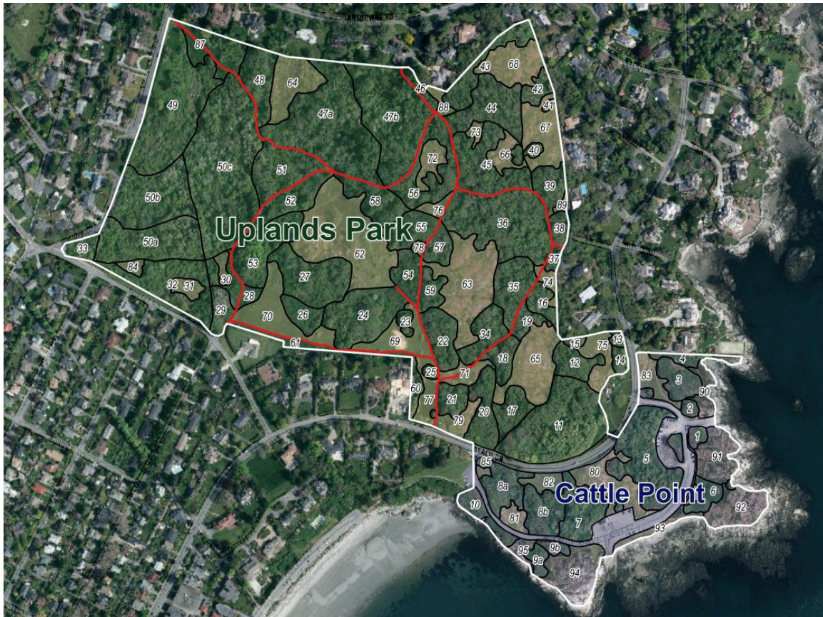
Figure 2—Map of Uplands Park and Cattle Point

Cattle Point , situated on the ocean side of Beach Drive, is a 5.5-hectare piece of land consisting of a rocky coastline aside the Victoria Harbour Migratory Bird Sanctuary, the oldest such sanctuary in Pacific Canada (established 1923). Cattle Point offers magnificent views of the water, islands and mountains, abundant birdlife and marine life, maritime meadows, and an impressive diversity of plants, some of them extremely rare and of national significance. With the exception of the many informal trails that crisscross its meadows, Cattle Point is fairly well developed and the most heavily used section of the park. It contains well-used boat launch ramps, a scenic waterfront drive, parking facilities, information kiosks, benches and picnic tables, and a single portable toilet (port-a-potty).