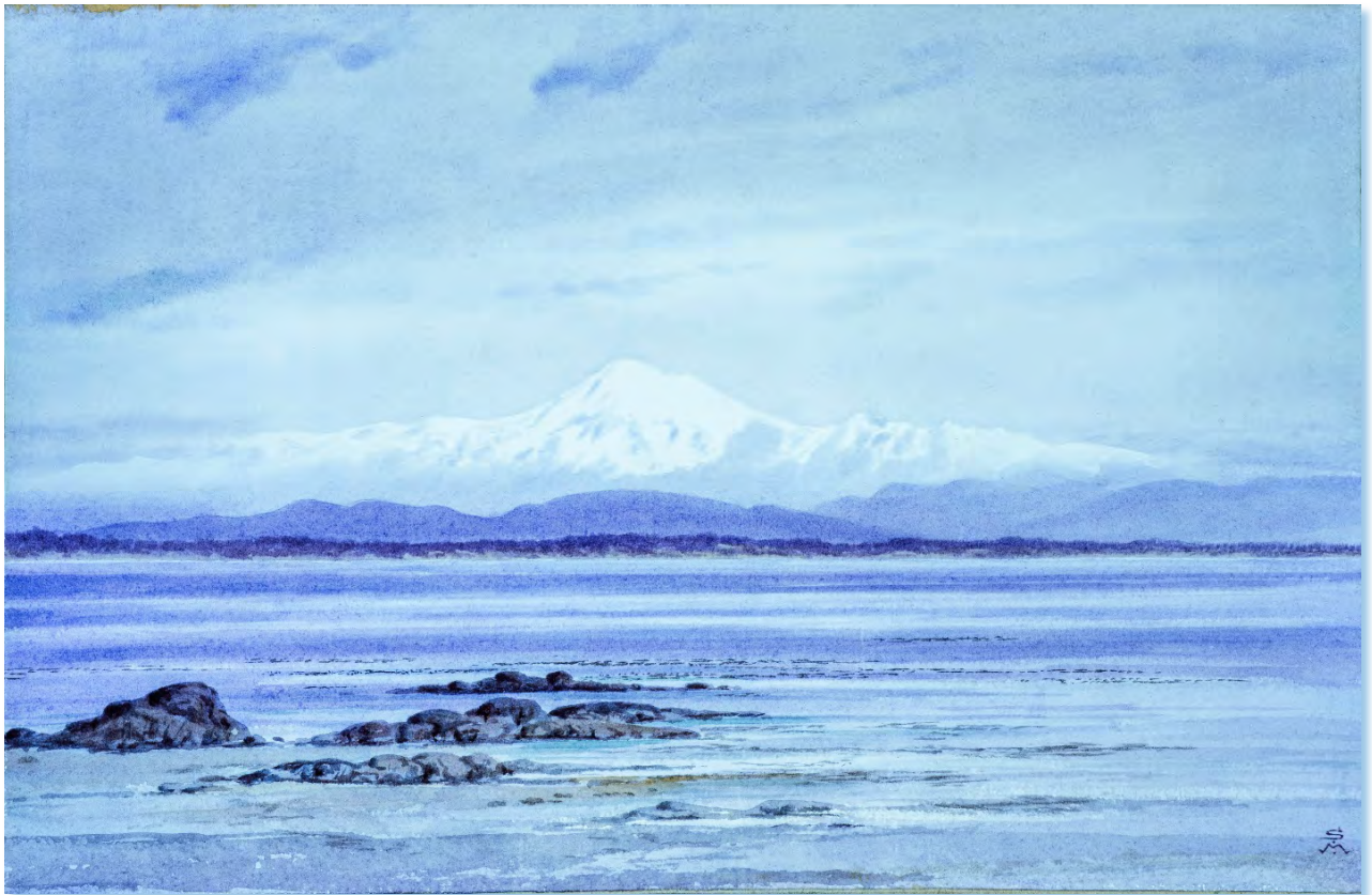
Mount Baker painted by Samuel Maclure, c. 1890