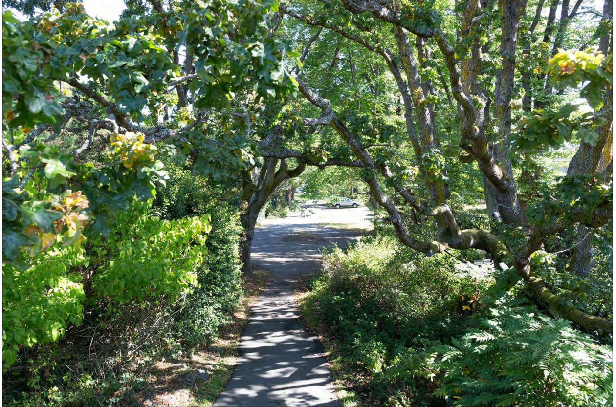
Native Garry oak trees bordering a pedestrian path in The Prospect neighbourhood.