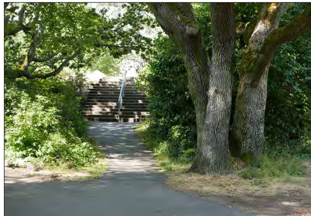
External and internal views in The Prospect demonstrating the importance of visual relationships to the character of the neighbourhood.