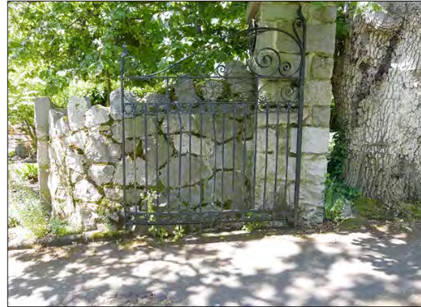
Stone wall and wrought iron gate belonging to the garden of The Gibson House property, demonstrating the use of traditional materials that help define the character of the neighbourhood.