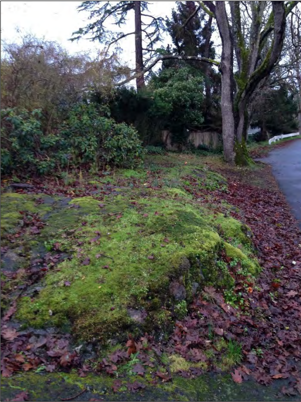
Examples of the bedrock outcroppings that characterize the topography of The Prospect.