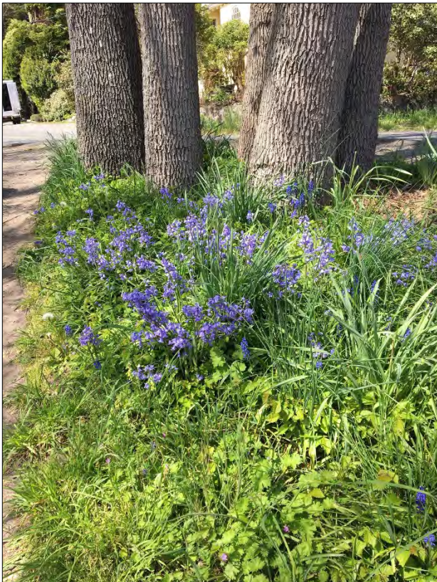
Examples of planted 'soft' boulevards with mixed vegetation and no curbs in the streetscape.