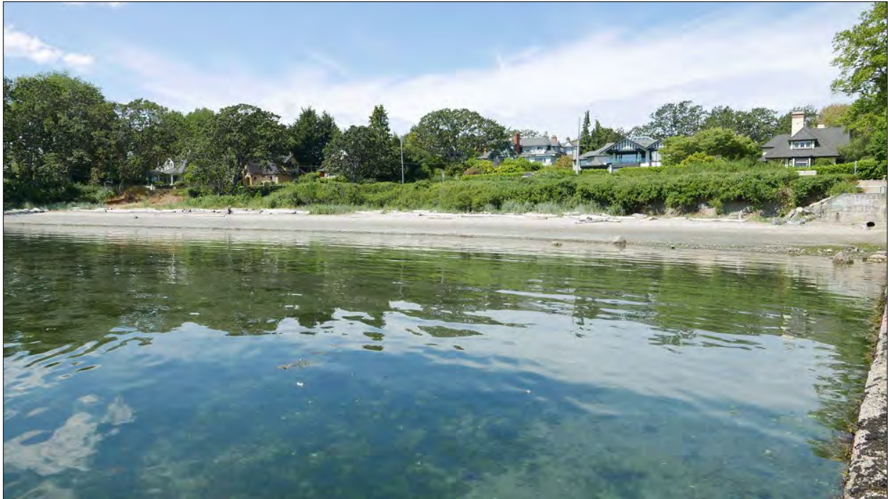
Shoreline of Rattenbury's Beach.