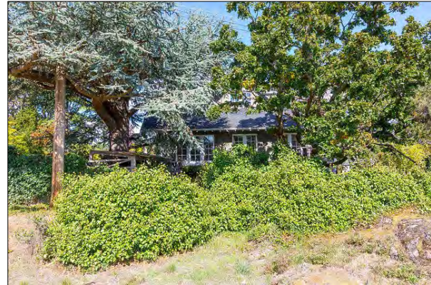
Natural materials such as gravel, stone and planted vegetation typical of the historic landscape.