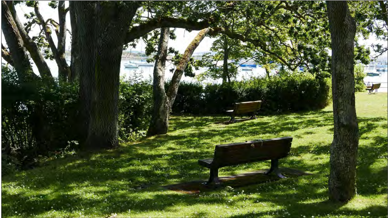
Haynes Park with Garry oak trees.