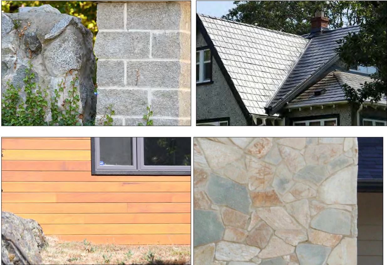
Examples of imitative modern materials and finishes that are not recommended for new construction in The Prospect.