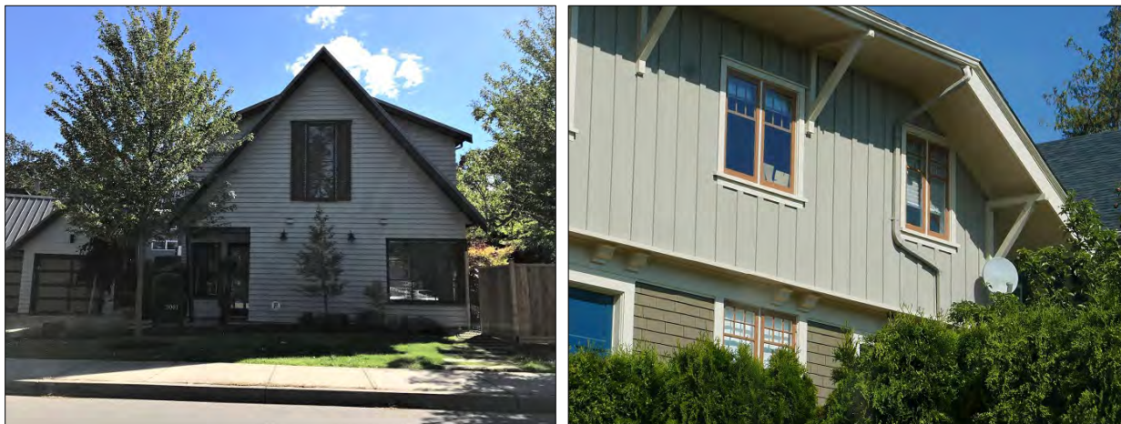
Examples of architectural detailing and forms that are complementary to the historic precedent. The example on the left uses contemporary design and traditional materials to achieve this, while the example on the right uses traditional design and traditional materials. Both examples are appropriate because the detailing is consistent with historic architectural styles in the neighbourhood.