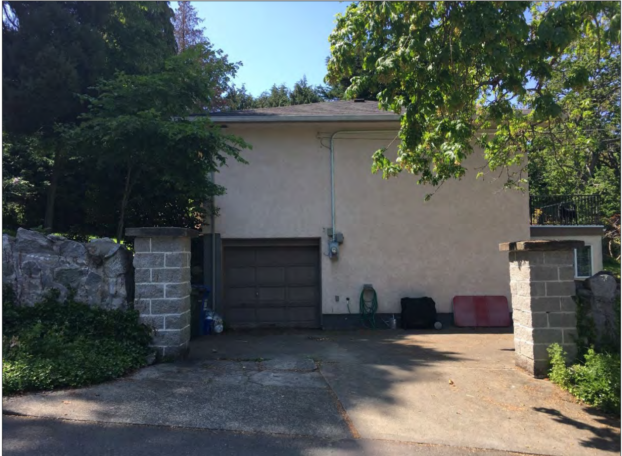
Example of inappropriate form, scale and massing (also demonstrating incompatible building materials, incompatible landscaping materials, an expansive and impermeable driveway and inappropriate door and window design).