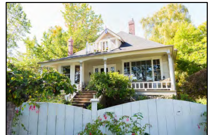
Some of the many historic homes in The Prospect.