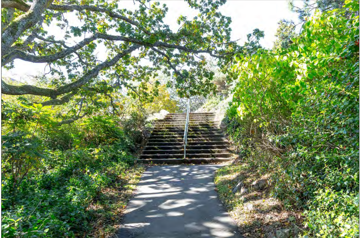
Example of an existing pedestrian thoroughfare leading to Haynes Park that exists in the open space between buildings.