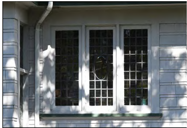
Examples of window types and patterns on existing buildings in The Prospect.