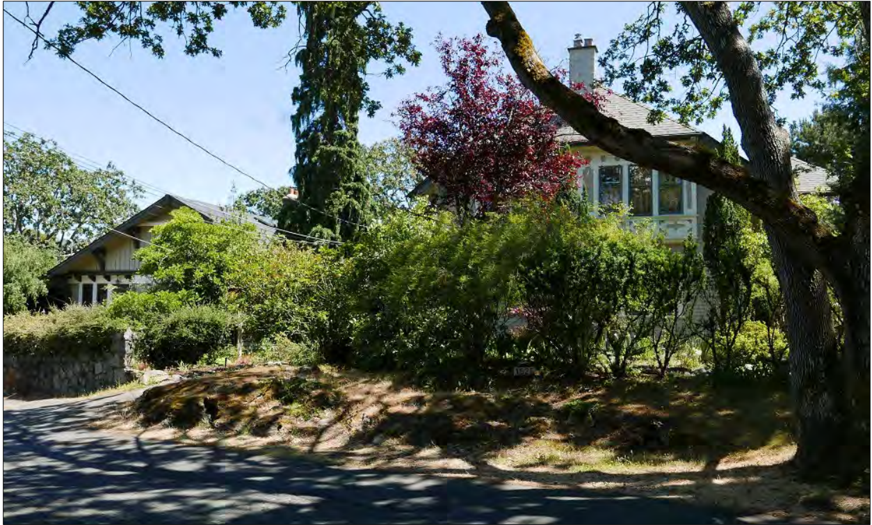
Historic examples of siting with large, front setbacks.