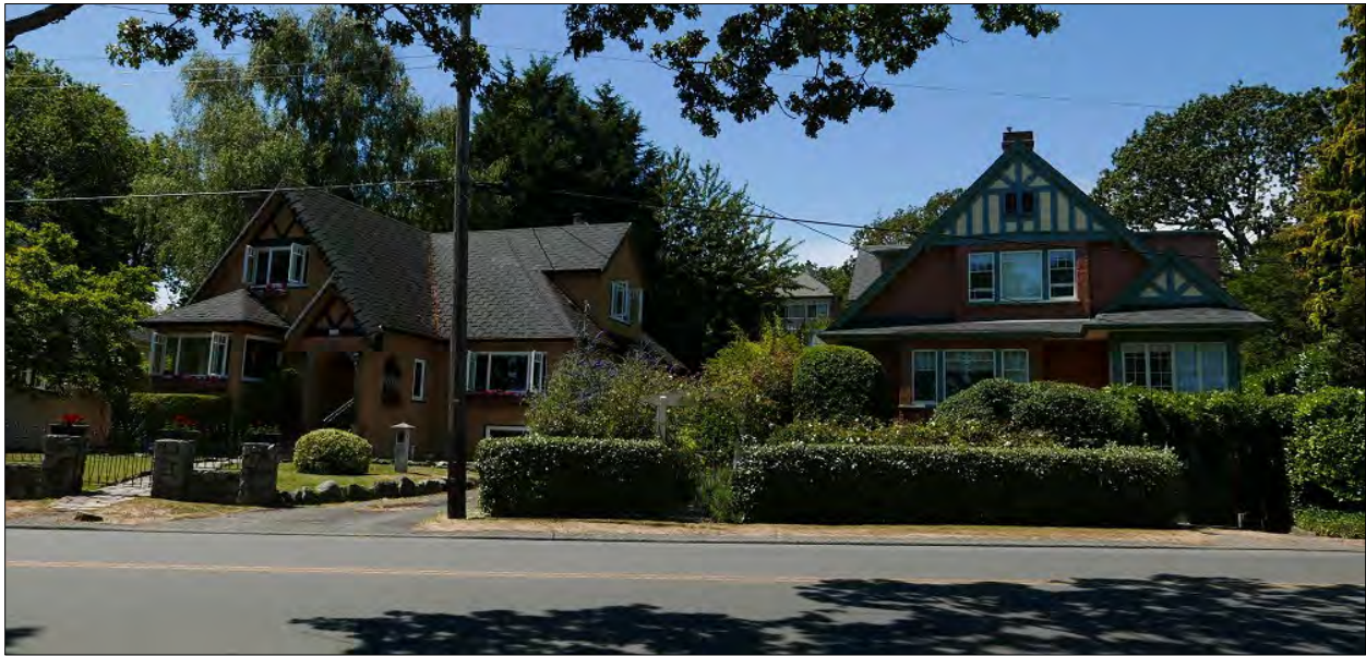
Examples of appropriate form, scale and massing.