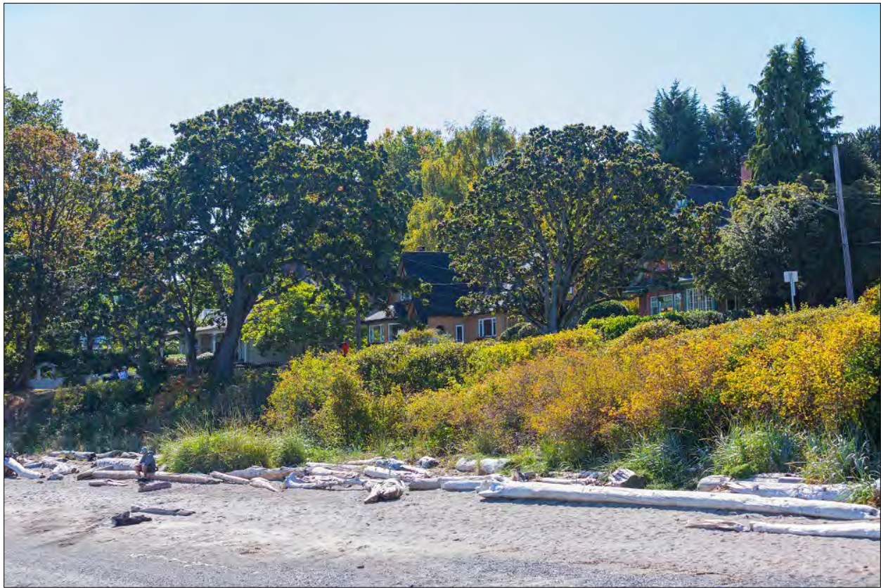
Trees, vegetation and shoreline at Rattenbury's Beach are examples of significant natural features and topography within The Prospect.