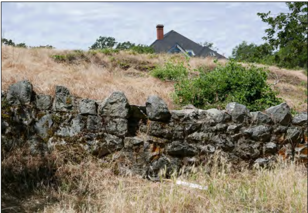
Terraced retaining walls that incorporate plantings and respect the natural topography.