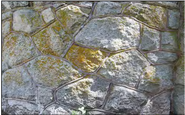
Examples of traditional materials used in The Prospect.