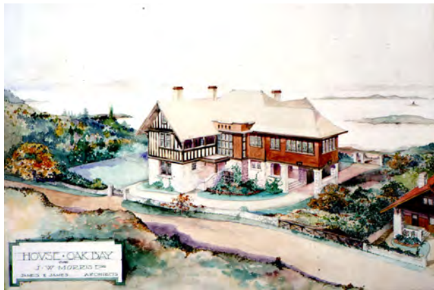
Watercolour by P. Leonard James (BC Archives PDP00576)

Each HCA is unique. They are designed to protect what a community values as special about a place and worth conserving for the enjoyment of future generations. Community heritage values are typically recorded in a document called a Statement of Significance (SOS). The SOS that has been created for The Prospect Heritage Conservation Area (The Prospect) explains why this neighbourhood warrants recognition as a historic place because of its unique combination of aesthetic, historic, social, environmental and educational values. The Prospect is one of Oak Bay's oldest neighbourhoods, and it contains a wonderful collection of historic homes created by some of BC's most prominent architects including Francis Rattenbury, Samuel Maclure and others.