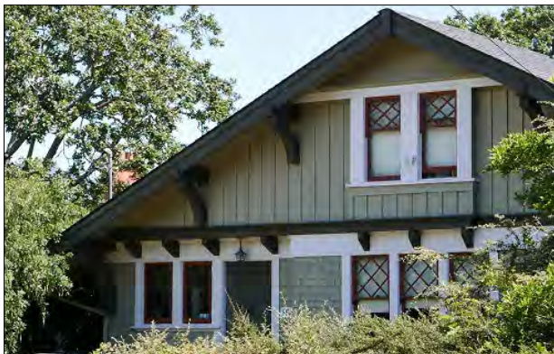
Examples of original architectural details that are important to maintain and conserve.