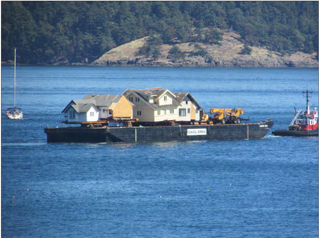
The removal of heritage from The Prospect will be regarded as demolition.

Demolition within The Prospect will not be permitted unless a building permit is approved by the District. The removal of heritage from The Prospect will be regarded as demolition.