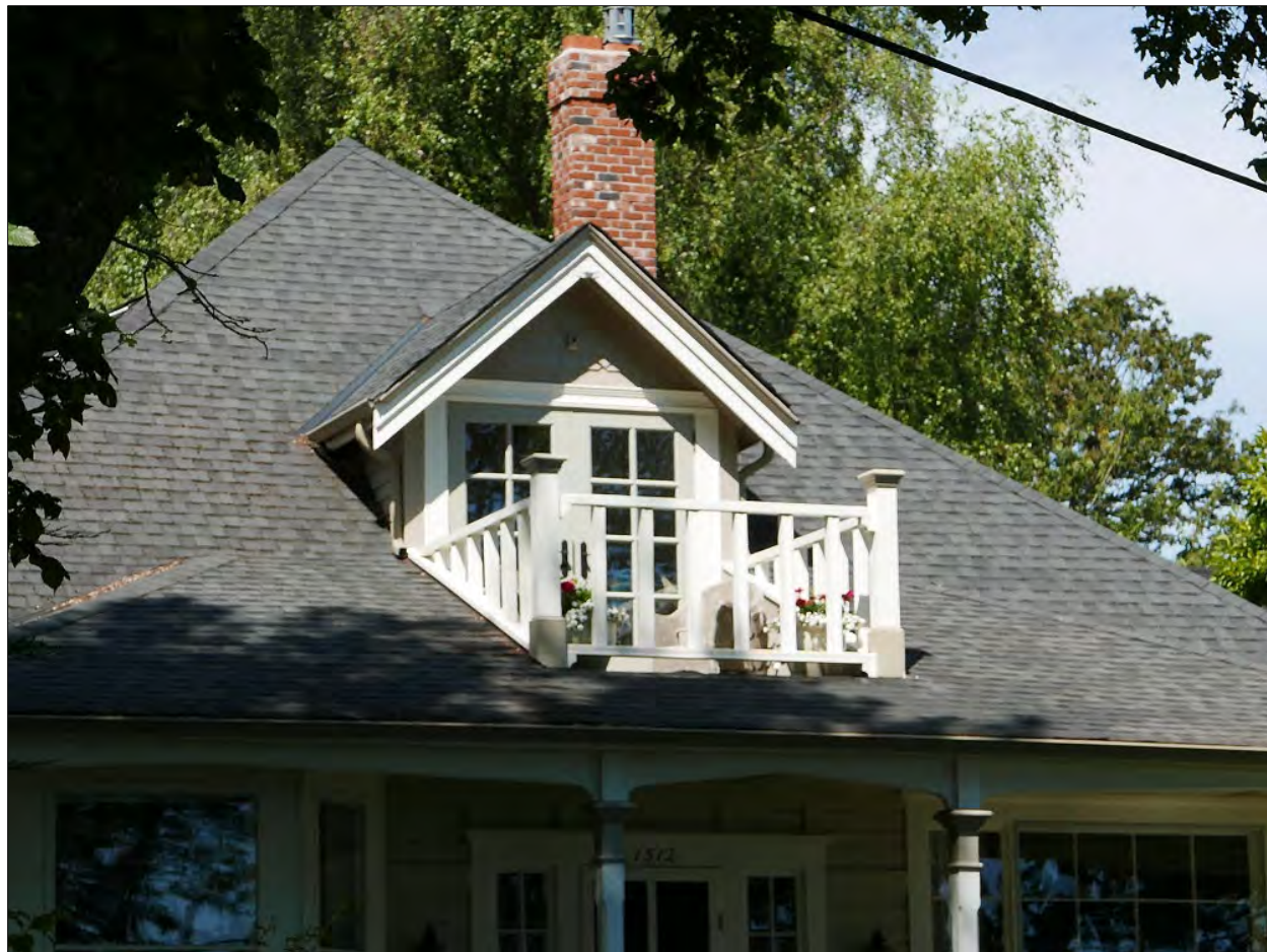
Example of a physically and visually compatible alteration to a protected building in The Prospect. The new dormer uses the same roof pitch as the original roof, and the architectural detailing is consistent with the original period of construction. The materials are also consistent with the original home.