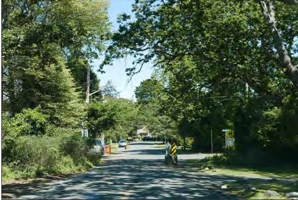
Examples of streetscapes within The Prospect showing wide boulevards and mature vegetation.