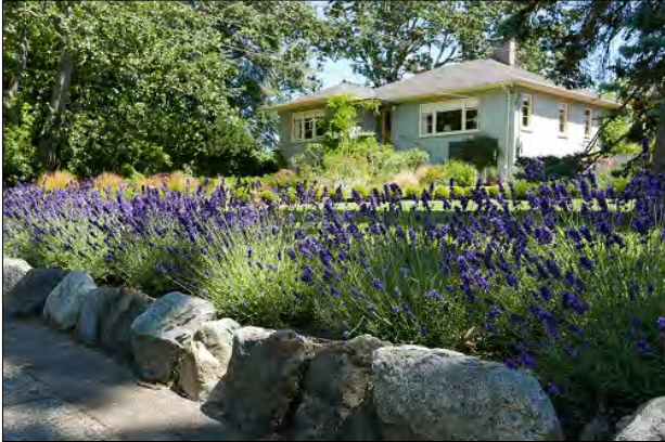
Examples of screening and layering with natural vegetation.