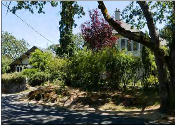
Integration of natural topography within the built environment of The Prospect.