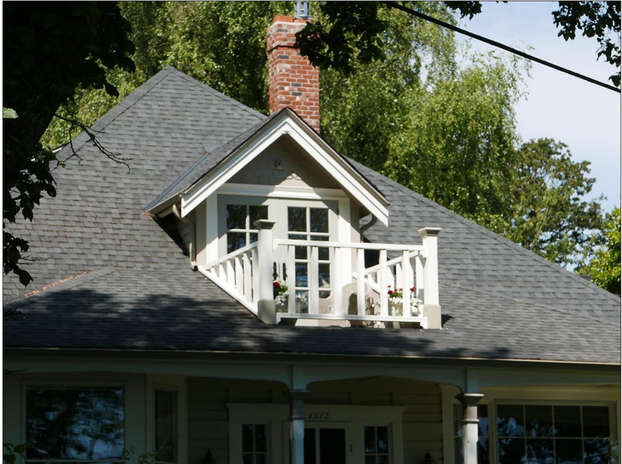
Example of a physically and visually compatible alteration to a protected building in The Prospect. The new dormer uses the same roof pitch as the original roof, and the architectural detailing is consistent with the original period of construction. The materials are also consistent with the original home.