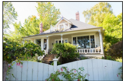
Some of the many historic homes in The Prospect.