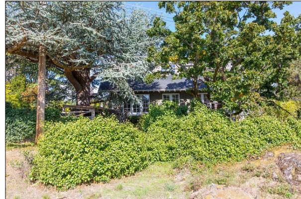
Natural materials such as gravel, stone and planted vegetation typical of the historic landscape.