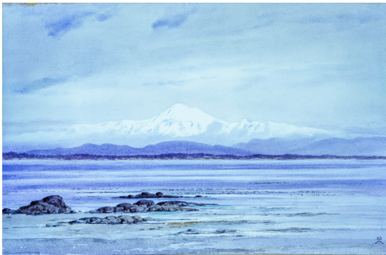
Mount Baker painted by Samuel Maclure, c. 1890