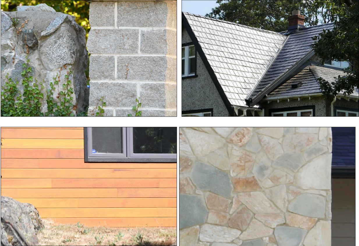
Examples of imitative modern materials and finishes that are not recommended for new construction in The Prospect.