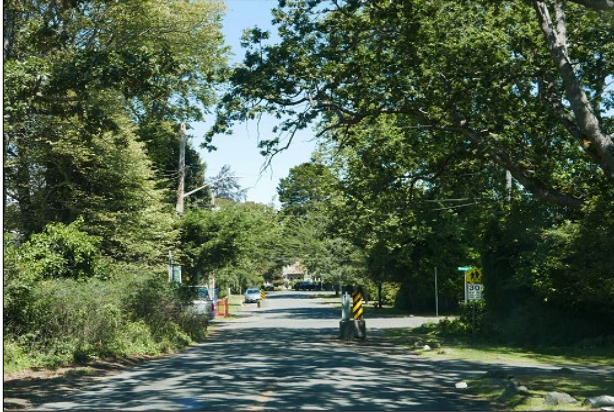
Examples of streetscapes within The Prospect showing wide boulevards and mature vegetation.