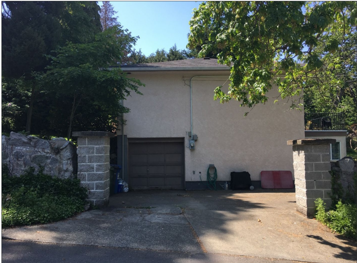
Example of inappropriate form, scale and massing (also demonstrating incompatible building materials, incompatible landscaping materials, an expansive and impermeable driveway and inappropriate door and window design).