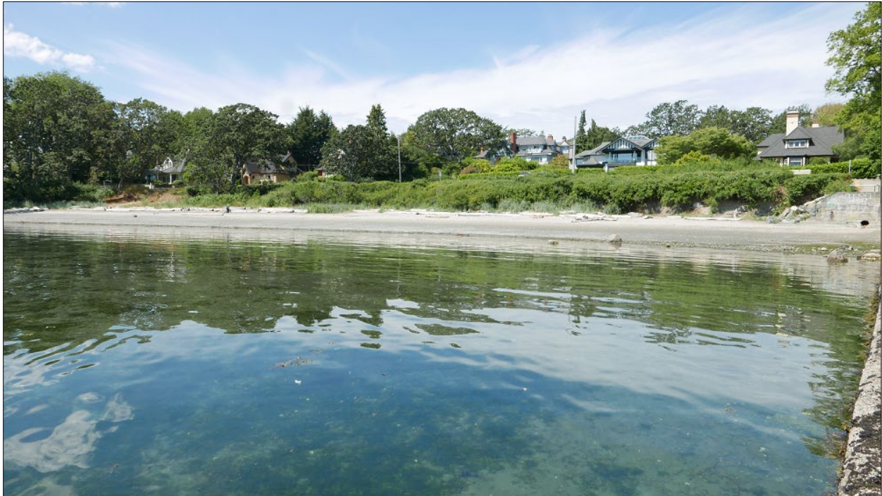
Shoreline of Rattenbury's Beach.