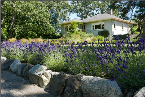
Examples of screening and layering with natural vegetation.