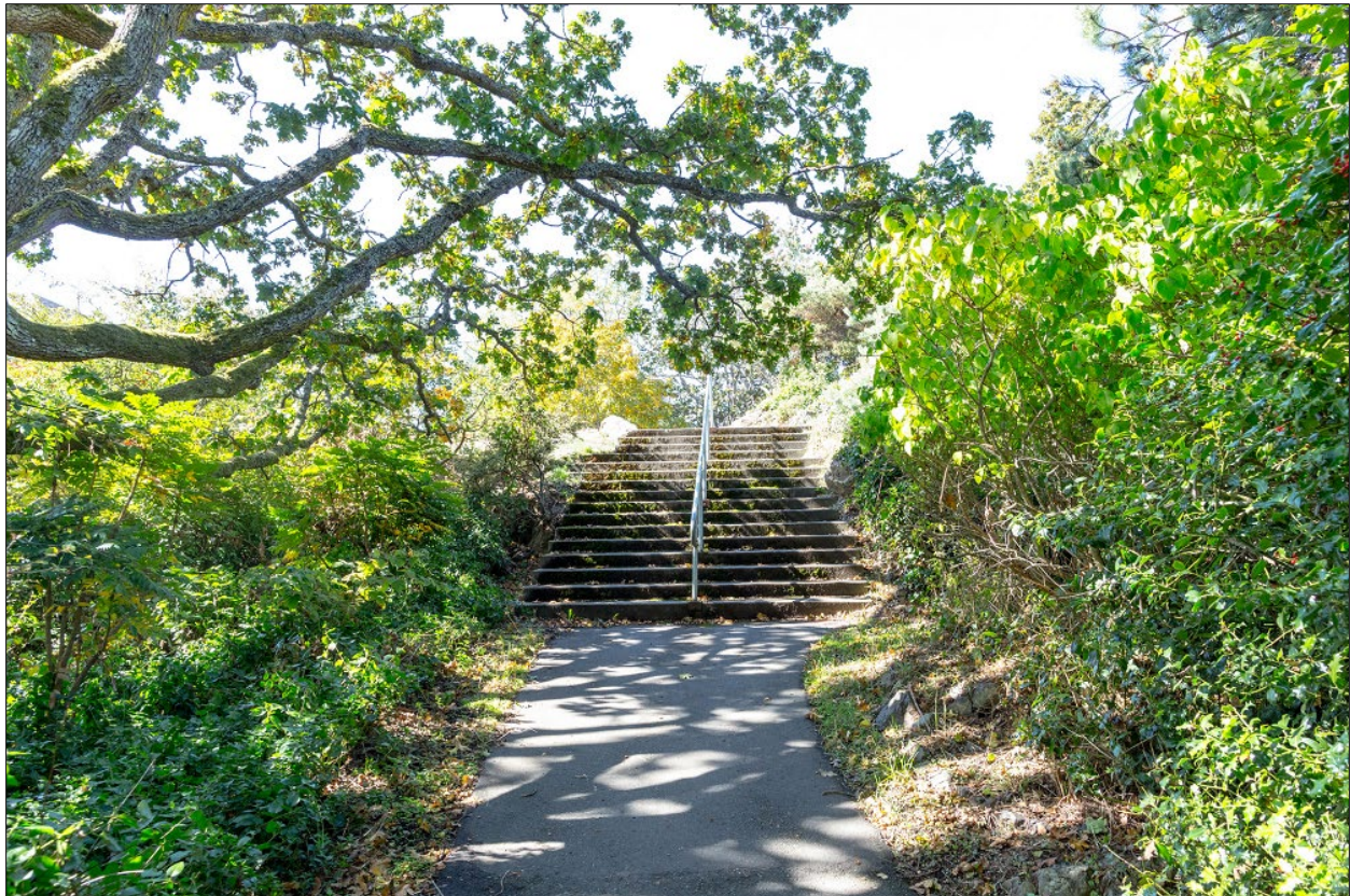
Example of an existing pedestrian thoroughfare leading to Haynes Park that exists in the open space between buildings.