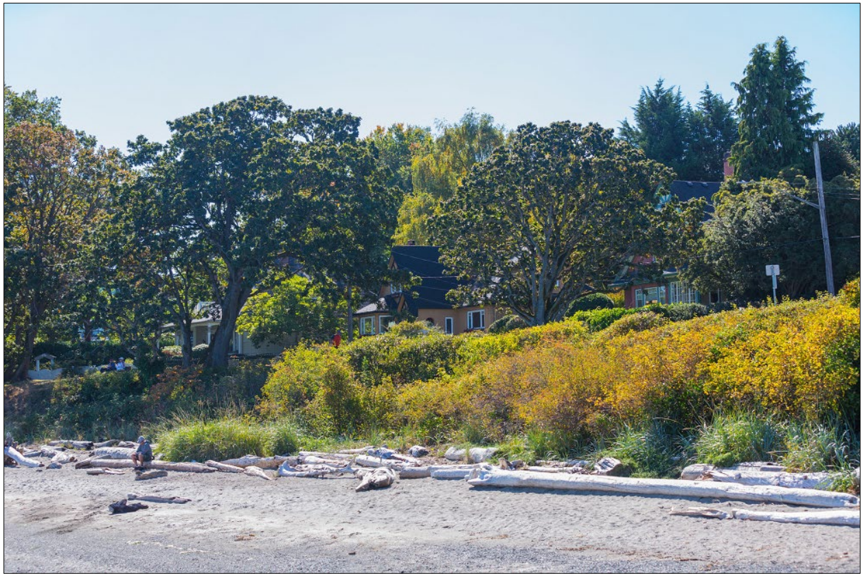
Trees, vegetation and shoreline at Rattenbury's Beach are examples of significant natural features and topography within The Prospect.