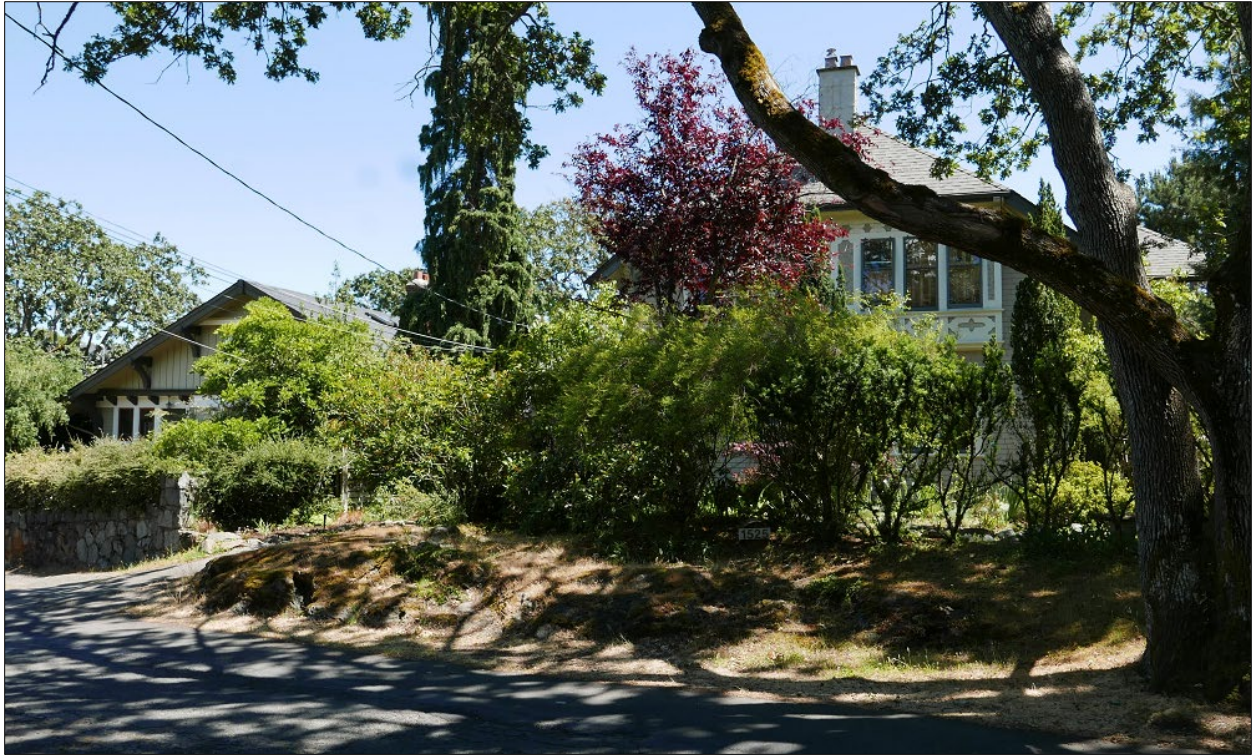
Historic examples of siting with large, front setbacks.