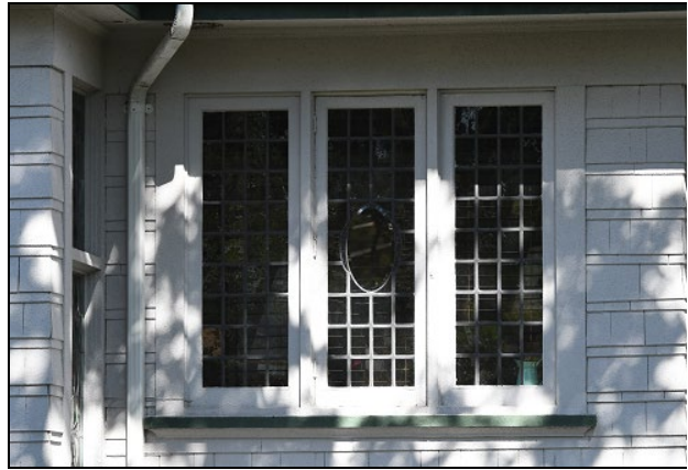
Examples of window types and patterns on existing buildings in The Prospect.