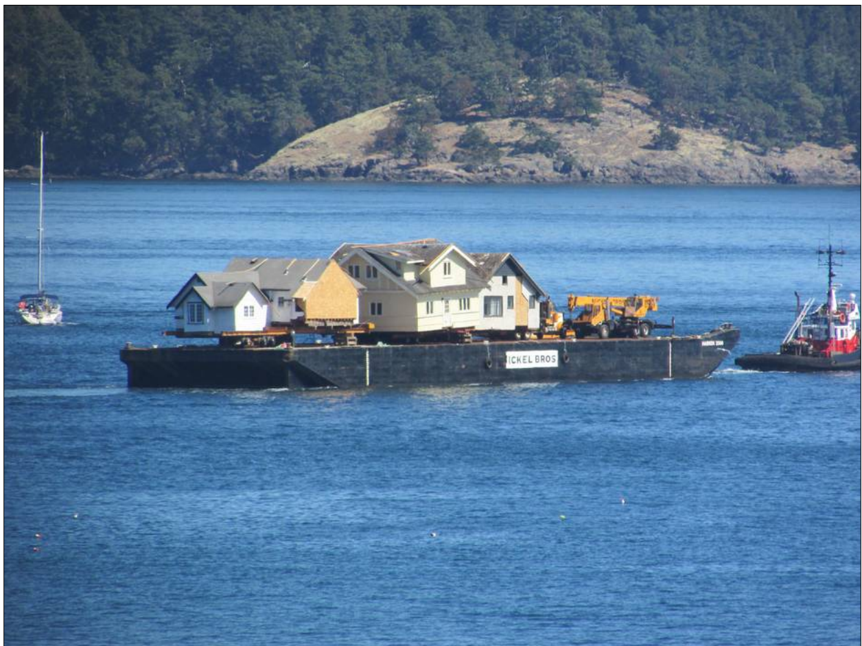
The removal of heritage from The Prospect will be regarded as demolition.

Demolition within The Prospect will not be permitted unless a building permit is approved by the District. The removal of heritage from The Prospect will be regarded as demolition.