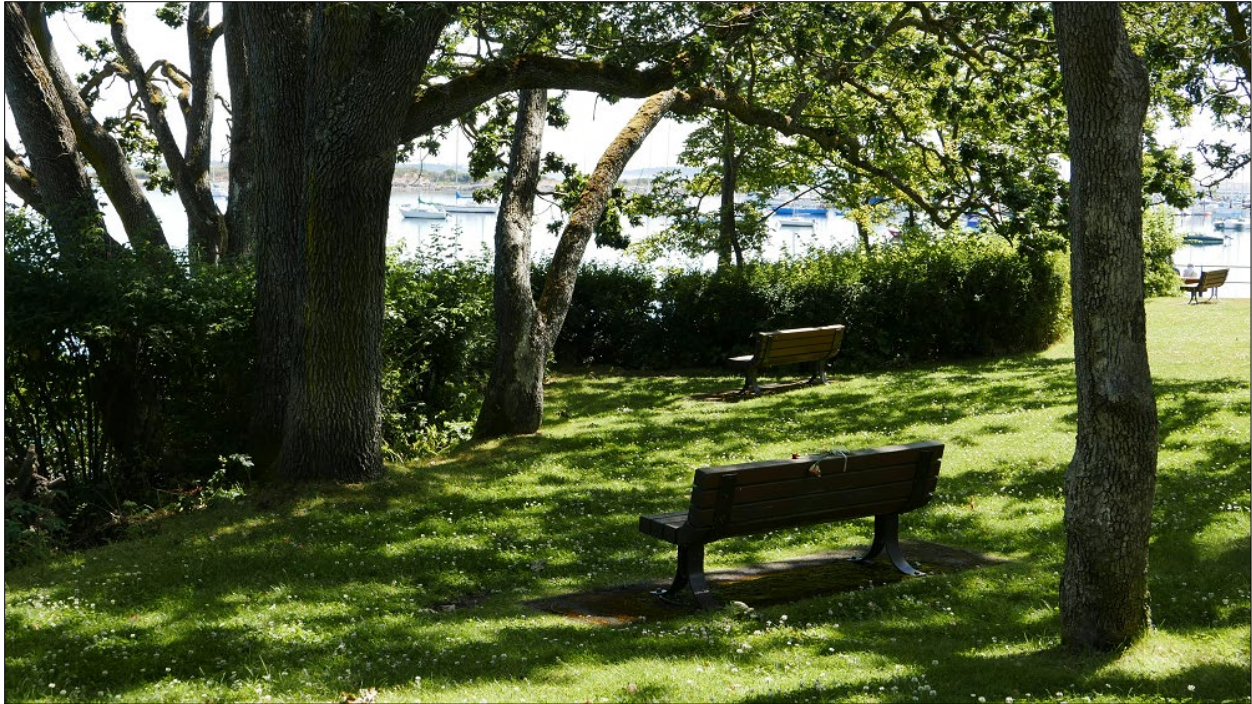
Haynes Park with Garry oak trees.