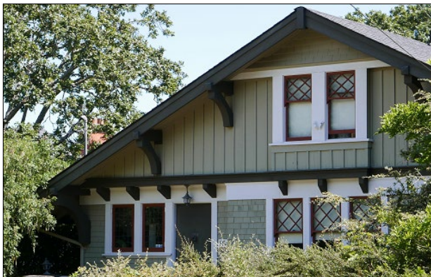
Examples of original architectural details that are important to maintain and conserve.