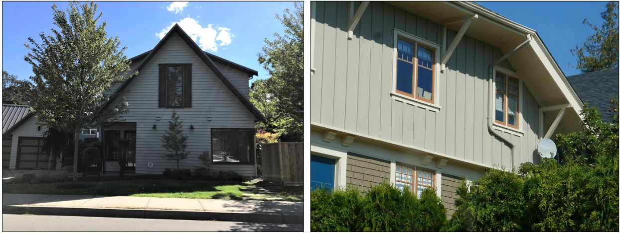
Examples of architectural detailing and forms that are complementary to the historic precedent. The example on the left uses contemporary design and traditional materials to achieve this, while the example on the right uses traditional design and traditional materials. Both examples are appropriate because the detailing is consistent with historic architectural styles in the neighbourhood.