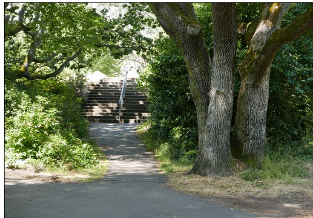
External and internal views in The Prospect demonstrating the importance of visual relationships to the character of the neighbourhood.