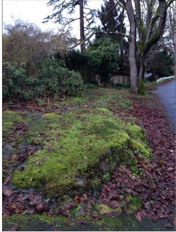
Examples of the bedrock outcroppings that characterize the topography of The Prospect.