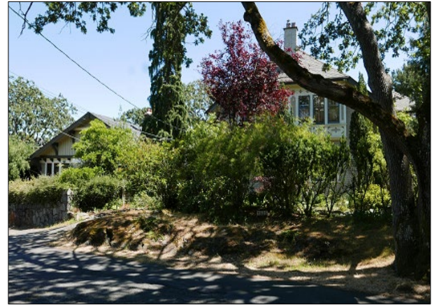
Integration of natural topography within the built environment of The Prospect.