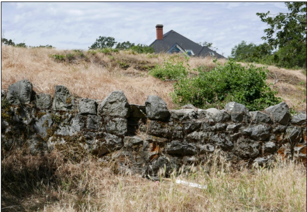
Terraced retaining walls that incorporate plantings and respect the natural topography.