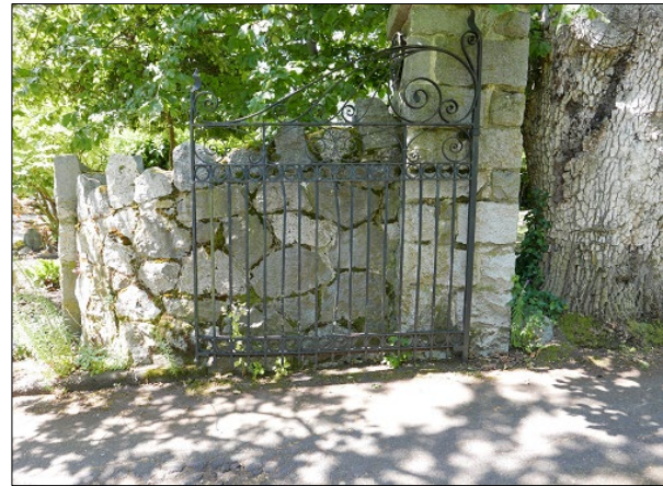
Stone wall and wrought iron gate belonging to the garden of The Gibson House property, demonstrating the use of traditional materials that help define the character of the neighbourhood.