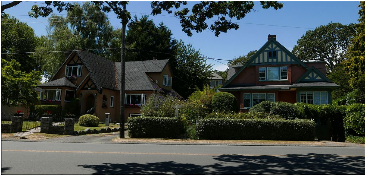
Examples of appropriate form, scale and massing.