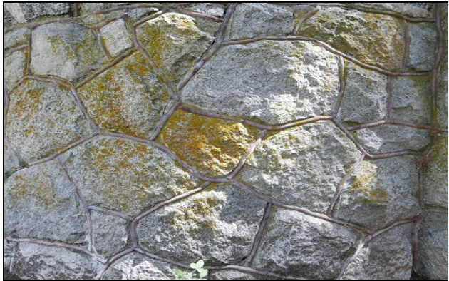
Examples of traditional materials used in The Prospect.